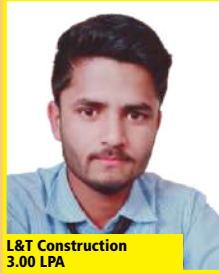
L&T Construction 3.00 LPA Auranjeb Diploma - EE